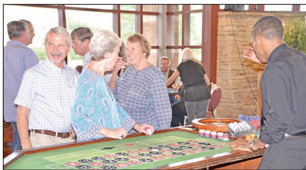
Habitat for Humanity Towns/Union Counties hosted a Casino Night to raise money for their upcoming home build on Saturday, Sept. 8.