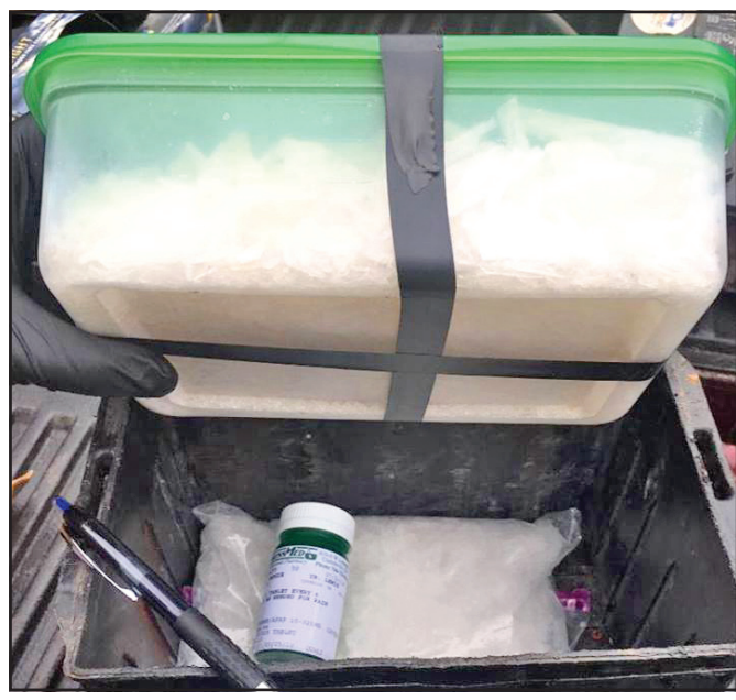
Some of the 15 pounds of meth seized in Operation Unicoi Pipeline.

On Wednesday, Sept. 5, See Pipeline, Page 8A